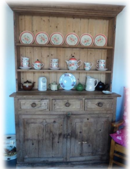
The Reminiscence Cottage